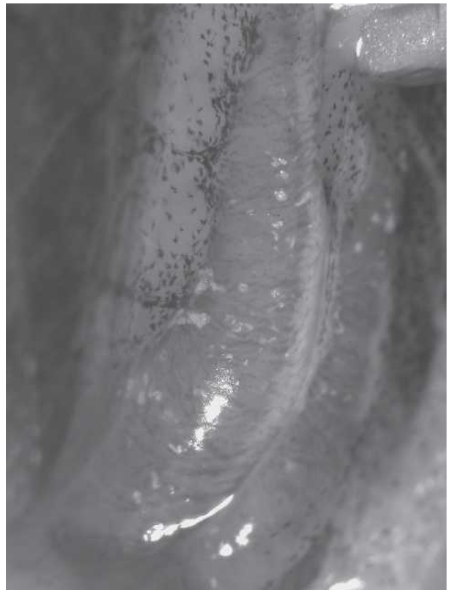
Figure 5 Relict leopard frog ( Rana onca ) from a captive breeding program with nephrosis due to oxalate toxicity. Recently metamorphosed frogs presented with marked effusions in their lymphatic sacs and coelom. Note the grossly visible multifocal white renal calculi present in the mesonephros (kidney). The feed of this colony of larval relict leopard frogs consisted of a diet rich in oxalate-containing plants (spinach).

Nutritional diseases associated with excessive vitamin and mineral supplementation may be a potential problem in tropical and neotropical captive amphibians in zoological parks and captive breeding programs. Recently, the dra-