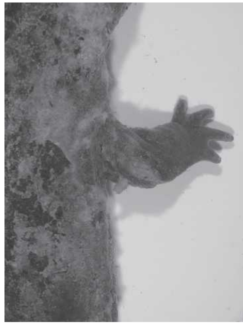
Figure 2 Severe cutaneous saprolegniasis on the right fore limb of a hellbender ( Cryptobranchus alleganiensis ) from a zoo. Note the grossly visible colonies of the water mold.

antifungal agents such as benzalkonium chloride, copper sulfate, or potassium permanganate (Taylor et al. 2001).