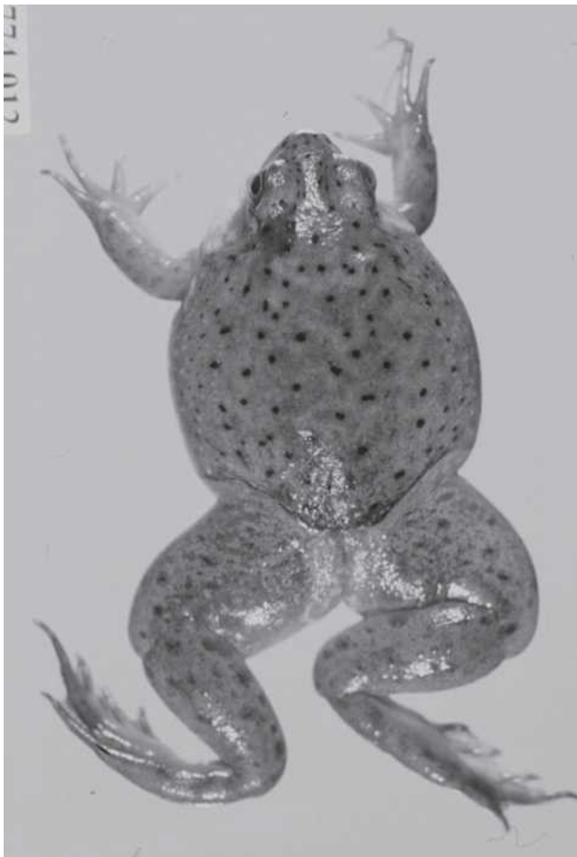
Figure 1 Free-living recently metamorphosed bullfrog ( Rana catesbeiana ) from New Hampshire with extensive effusion into lymphatic sacs of the body and thighs. Although virus cultures were negative, investigators suspected ranavirus infection. Several other infectious and noninfectious diseases may present with effusions in the lymphatic sacs and body cavity.

frogs in the 1960s, TEV is closely related to FV-3 (Hyatt et al. 2000) and occurs with the same clinical presentation in premetamorphic frogs and toads (Wolf et al. 1969). Ranaviruses that closely resemble FV-3 and TEV have been reported throughout the United States in association with die-offs of tadpoles and metamorphs, with mortality rates sometimes exceeding 90% (Green et al. 2002; Greer et al. 2005). Bohle iridovirus (BIV) is a ranavirus detected in anurans in Australia (Speare and Smith 1992). The virus affects both pre- and postmetamorphic life stages of anurans and experimentally infects and causes disease in the barramundi ( Lates calcarifer ), a catadromous species of fish. Docherty et al. (2003) and Jancovich et al. (1997) have associated die-offs among populations of tiger salamanders ( A. tigrinum ) in the western United States and elsewhere, with the Ambystoma tigrinum virus (ATV) 2 , which primarily infects larvae. Docherty et al. (2003) have linked additional salamander die-offs among populations of spotted