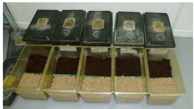
Figure 1. Choice chambers used to assess substrate preference in G. seraphini , with Megazorb to the front of each chamber and coir to the rear.

The position of each caecilian was recorded once every day between 09:00 and 16:00 hrs by gently lifting the choice chamber. Location could be established mostly without disturbing animals because parts could usually be seen through the clear base and/or sides of the chamber. Otherwise the position of each caecilian had to be established by sifting through the substrate in the choice chamber by hand. A control was not deemed appropriate in this study because health issues had been observed in animals that had been provided coir as a substrate. Because Megazorb had not previously been used as a substrate for caecilians it was not considered appropriate to house them on this substrate alone. The experiment ended after 39 days, on the ninth of February 2014, the G. seraphini were weighed and two separate groups transferred to enclosures with a Megazorb substrate.