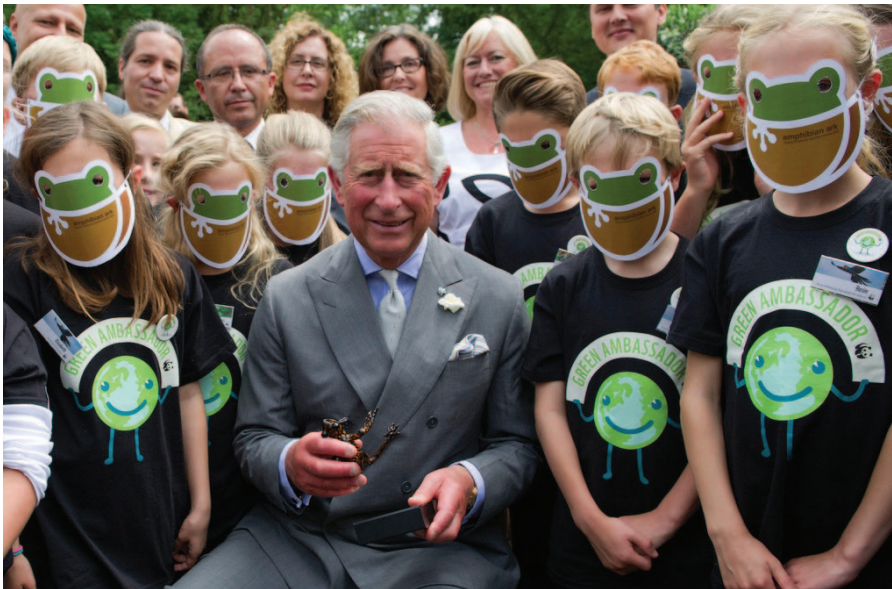
Prince Charles, Prince of Wales poses with a group of school children wearing AArk masks, and an Ecuadorian stream tree frog named in his honor.

and some tadpoles in nearby areas. The frogs were found at night climbing on branches close to a waterfall of about eight meters high. For research and conservation purposes, some tadpoles were transported alive to the Centro Jambatu. DNA analyses have confirmed that this is indeed a new species for science; but, sadly, a species that is already Endangered by IUCN Red List criteria. If this rare species is to persist in the wild, it requires further scientific and conservation action in the field and in the laboratory.