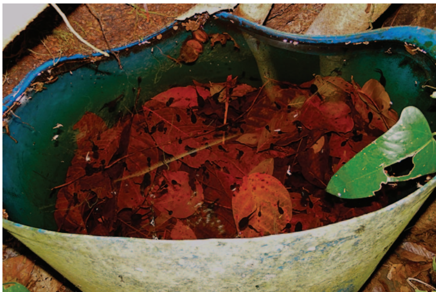
An artificial rearing site for Cruziohyla calcarifer, the Splendid Leaf Frog at the CRARC reserve in Costa Rica.

the area, one has to wonder how such methods can benefit other aspects of amphibian research and conservation. Could these methods also be utilized in support of in situ disease research for example or perhaps studying patterns of declines or emergences, etc? Clearly, there is a need for this research to continue as alternatives to ex situ programs. Involving local stakeholders to go beyond and get directly involved with in situ management techniques may well be the future for amphibian conservation. At the Costa Rican Amphibian Research Center, they have been leading the way to find out!