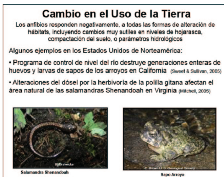
A sample panel from the Spanish-language version of the Amphibian Declines Teaching Module.

For more information, or copies of these materials, please contact Joe Mendelson: ncep@amnh.org