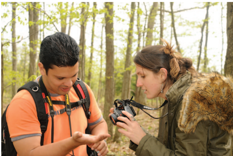
Students from Costa Rica and Brazil participate in field training in Toledo.