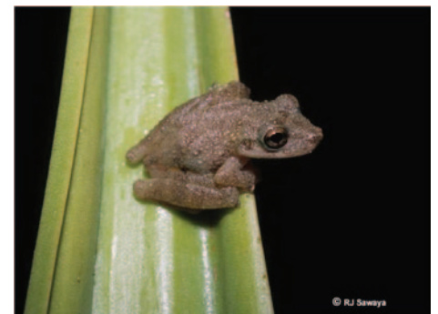
The Critically Endangered Scinax alcatraz is being bred in an ex situ population at São Paulo Zoo in Brazil. Husbandry techniques for this species were developed by housing a surrogate species, S. perpusillus .

The facility consists of a section for permanent housing of the animals, one for culturing live food, and a bathroom with a shower. Staff are required to take a shower before and after working with the animals and everything that goes inside the room has to be disinfected before it is taken inside. The husbandry equipment was bought with the funds from the AArk Seed Grant funding, as outlined in the following table: