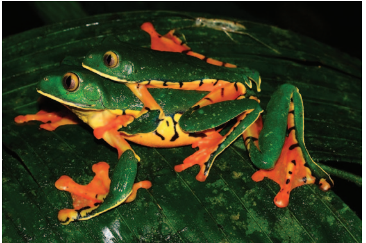
Splendid Leaf Frogs ( Cruziohyla calcarifer) in amplexus at the Costa Rican Amphibian Research Center.