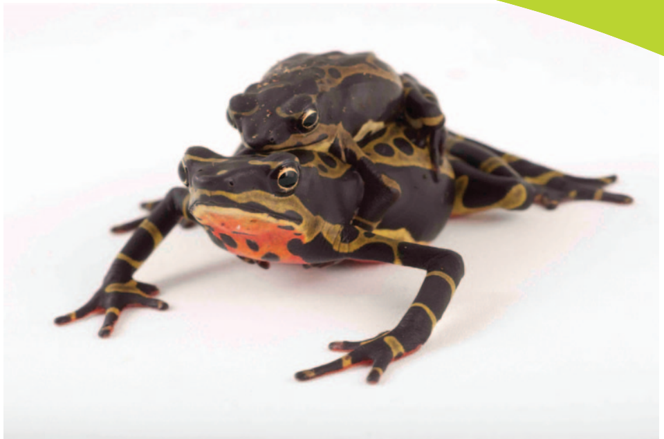
Above: A pair of Atelopus sp. ( spumarius-pulcher complex) in amplexus. This species was bred at Centro Jambatu late in 2011. Below: The tadpoles remained close to each other for several days. Although a number of tadpoles died during their development, nineteen juveniles from this breeding still survive.