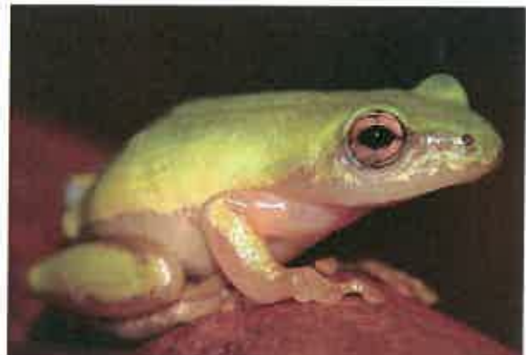
A female Pickersgill's Reed Frog, Hyperolius pickersgilli

Authors: Jeanne Tarrant 1 & Adrian Armstrong 2