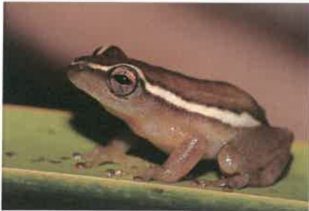
A male Pickersgill's Reed Frog, Hyperolius pickersgilli