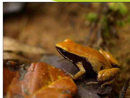
Mantella crocea is listed as Endangered in the IUCN Red List, and Association Mitsinjo hopes to breed this species in the first biosecure facility for captive amphibians in Madagascar

Three cricket species and a fruit fly are being bred for food, with additional live food culturing experiments being conducted to expand the captive frog diets.