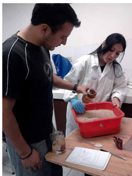
Preparing a medium for breeding moths in the genus Galleria at the Balsa de los Sapos, Pontificia Universidad Católica del Ecuador, Quito.

Training took place from October 10 to November 9 in 2010 at two important amphibian breeding and managing centers in Ecuador: Balsa de los Sapos, at Pontificia Universidad Católica del Ecuador, in Quito and Centro de Conservación de Anfibios Mazán, in Cuenca.