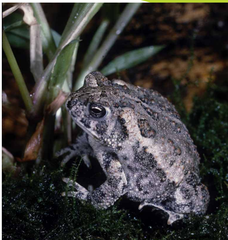
The purpose of the captive population and managed breeding program for Wyoming Toads is to maintain a genetically diverse assurance population of this species and to provide animals for release.

On the other hand, the population at our current Safe Harbor release site seems to be taking hold. Males were heard calling this spring, and a group of tadpoles found on the site may be the result of a wild breeding - if so, this would mark a landmark event for the recovery program!