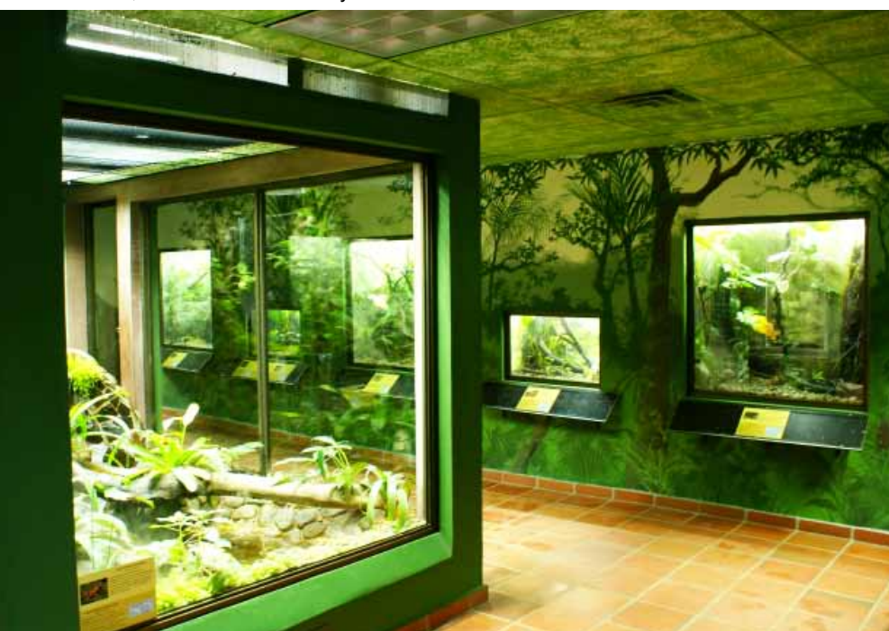
The public exhibition hall at the El Valle Amphibian Conservation Center.

We could definitely say that EVACC has grown and accomplished a lot within the last five years, and we will continue doing so until we can find a way to bring all the animals back to where they belong.