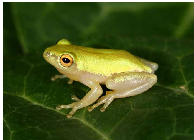
Pickersgill's Reed Frog, Hyperolius pickersgilli , occurs in limited and fragmented habitat along the KwaZulu-Natal coastline of South Africa.

Subject to the creation or rehabilitation of suitable wetlands we may ultimately decide to release captive-bred individuals back in the wild. Large scale dune mining operations likely to take place within the range of this species in the near future will include mandatory site rehabilitation (and funding) that could also provide ideal opportunities to create wetland habitat suitable for reintroduction programs.