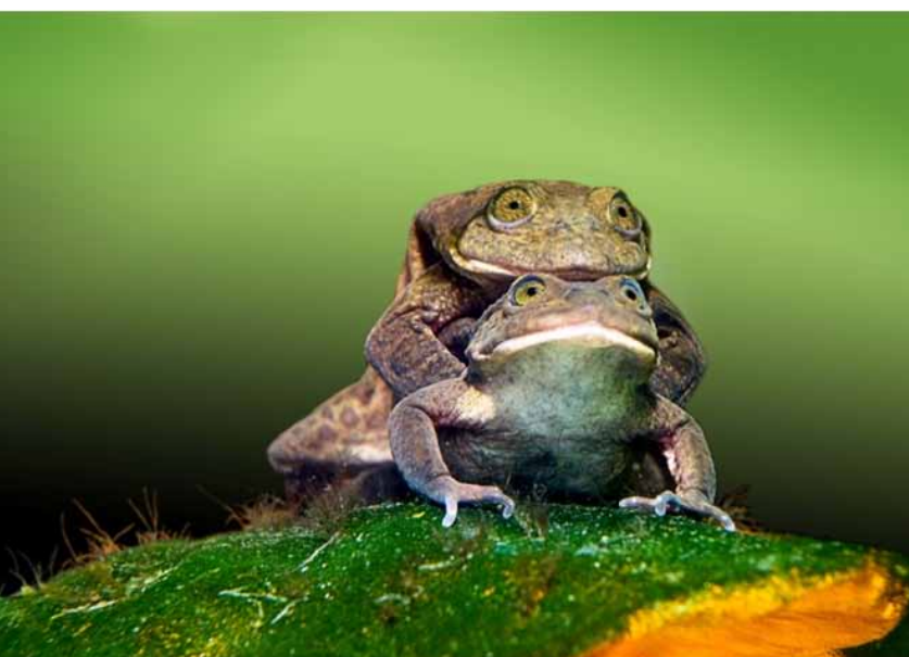
The Water Frog, Telmatobius hintoni , is one of the model species being maintained in the captive breeding facility in the Museo de Historia Natural Alcide d'Orbigny in Bolivia.