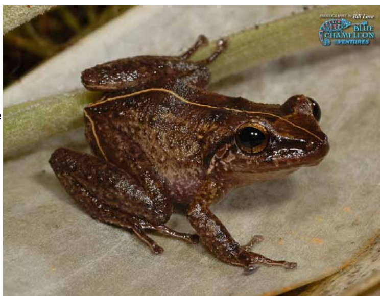
The Coqui, Eleutherodactylus coqui , is native to Puerto Rico.