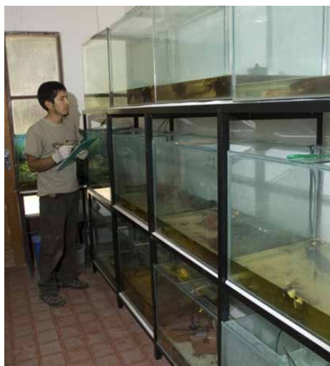
The first facility in Bolivia to keep different species of Telmatobius , where some of the species already have offspring and some others will be breeding soon.