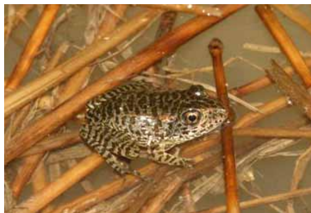
A head-starting program for Carolina Gopher Frogs, Rana capito capito, is being undertaken by the North Carolina Aquarium at Fort Fisher. In June and July this year, 230 frogs were released to the wild.