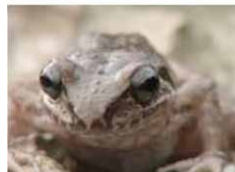
Some of the endemic animals of Pic Macaya include (from top to bottom) Mozart's Frog, the Ventriloquist Frog, La Hotte Frog and the Blue-eyed Gland Frog.