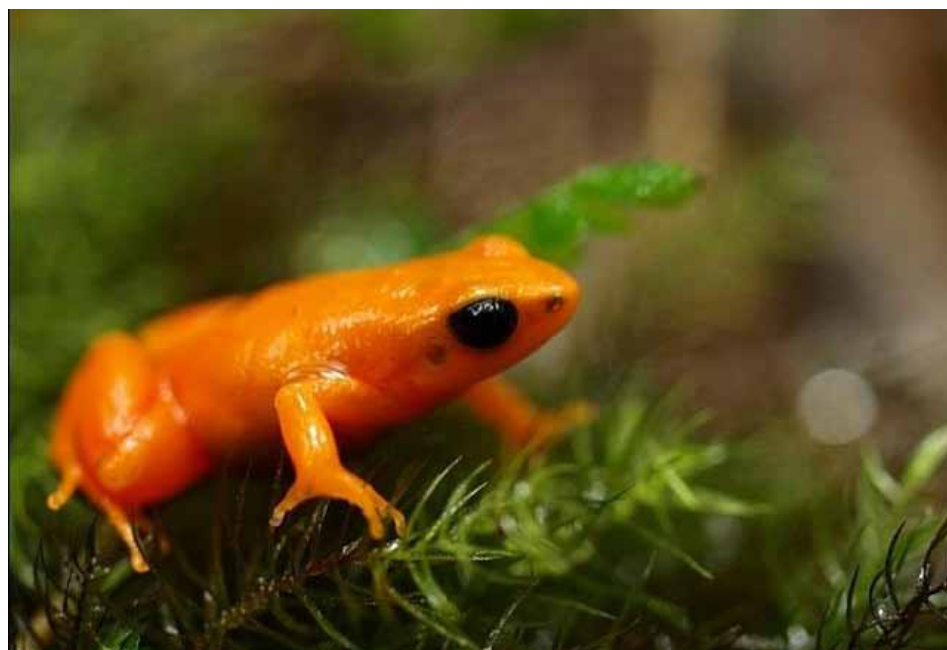
The Critically Endangered Mantella aurantiaca is found in the area around Andasibe in east-central Madagascar and is one of several species that will be maintained by Association Mitsinjo.

Association Mitsinjo, a community-run conservation organization centered in Andasibe, has developed the first biosecure facility for captive amphibians in Madagascar. It will serve as an example and training center for additional captive amphibian programs. Five locally-hired technicians are currently working with four common frog species to learn how to keep and breed amphibians in captivity.