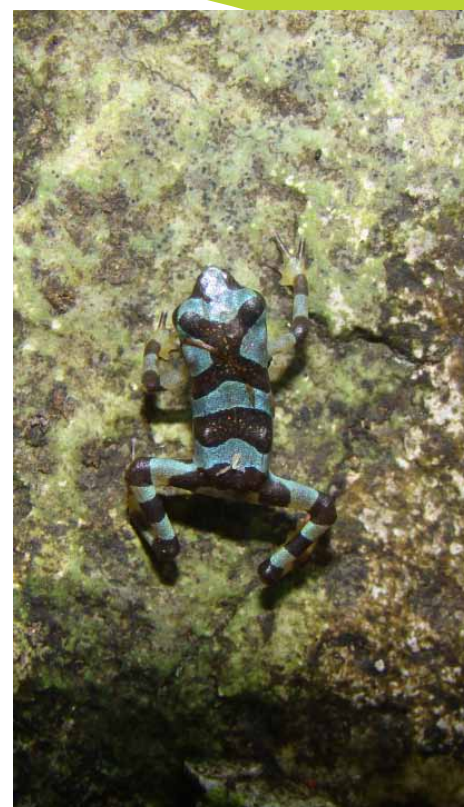
One of the juvenile Atelopus varius that was released in the same area the founders were collected up to three years ago.

We can also choose what we feed our frogs, having the privilege of working with two species of fruit flies, domestic crickets, super worms, earth worms and katydids.