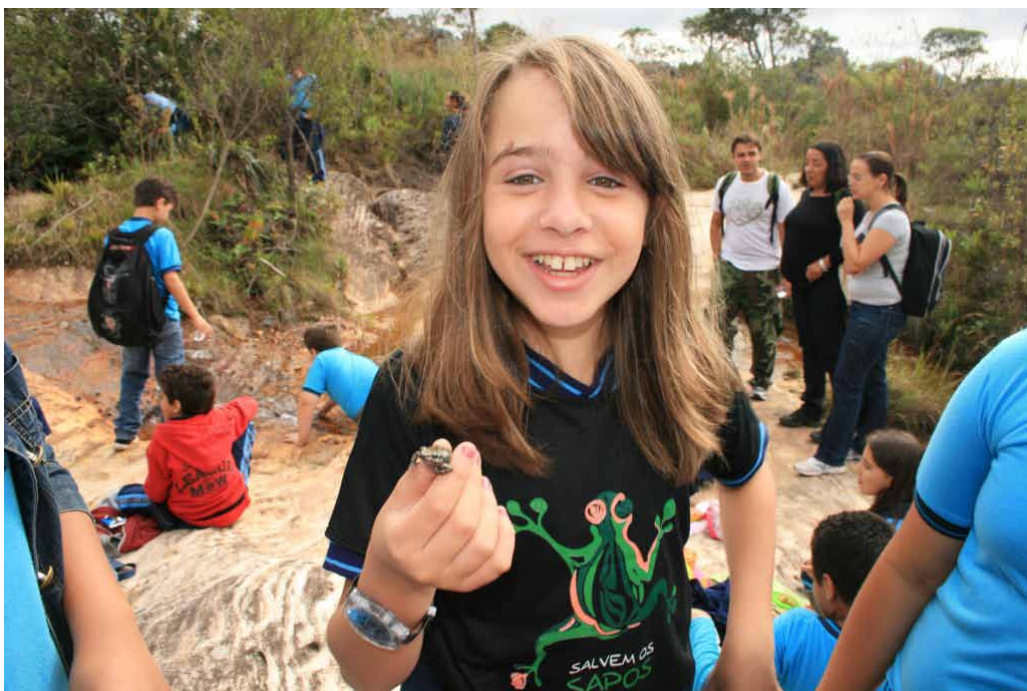
Students from local schools around the Espinhaço Range in Brazil get involved in the project to understand that amphibians are healthy components of the ecosystem.

Contact: Izabela Barata, Research Scientist, Instituto Biotrópicos, izabela@biotropicos.org.br