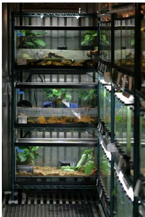
Amphibian “pods”, made from recycled shipping containers like this one at the Atlanta Botanical Garden (above and below) are a great way of providing low-cost biosecure amphibian breeding facilities.

population. Amphibians held across multiple generations, like other species in captivity, risk losing gene diversity, producing deleterious allele combinations, and artificial selection for maladaptive traits. A captive population of Midwife Toads showed reduction in fitness and gene diversity after only nine generations. Moreover, many amphibian species exhibit traits that make it difficult to manage them with ‘mammal-based’ management software.