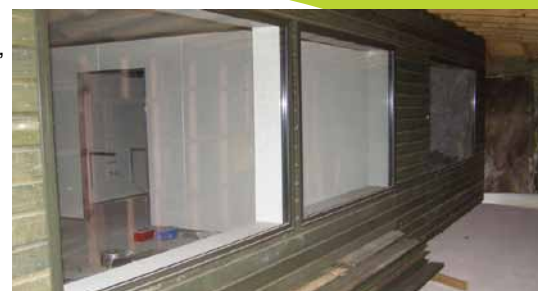
The inside of Orana Wildlife Park's Maud Island Frog Habitat showing the areas in which the Maud Island Frogs will be housed (photo taken from the public walkway though the habitat).

At the moment we are holding five species of Telmatobius from several localities in Bolivia. Using these species, we hope to increase our knowledge about the species through research in captivity, and this knowledge can then be used