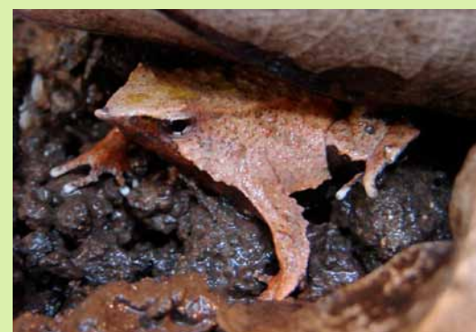
The ex situ program for Darwin's Frog, Rhinoderma darwini, in Chile is a great example of a conservation partnership, formed by the Universidad de Concepcion and Leipzig Zoo.