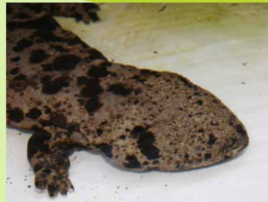
The very successful captive program for the Japanese Giant Salamander, Andrias japonicus, which began in 1971 at Asa Zoo, is one of longest-established ex situ programs for amphibians.

So as this summary shows, we have made some significant steps forward with regards to the rescue of threatened amphibian species. There still remains a large number of species that need our help, and if we continue to expand our ex situ capabilities and skills, we can continue to improve upon the great work that has been done over the past few years.