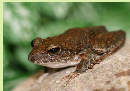
Taronga Zoo's program for Booroolong Frogs, Litoria booroolongensis , includes community education and releases to the wild.