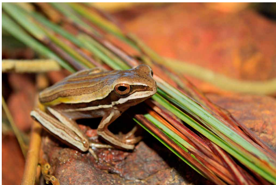
Hypsiboas cipoensis : a Near Threatened and endemic species from the Espinhaço Range.