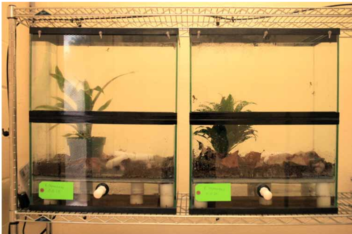
The custom made 20-gallon tall tank set-up for arboreal Haitian frogs at the Philadelphia Zoo. The tiny frogs (less than 2cm long) seen crawling on the glass are adult Macaya Breast-spot Frogs, Eleutherodactylus thorectes, which are one of the smallest land vertebrates on Earth.

These are some of the most endangered animals in the world and we are making our best efforts to perfect the right husbandry and breeding protocols for these three and the remaining seven species. We do this with the main goal of reintroducing these species back to their reconstructed and protected native range in Haiti.