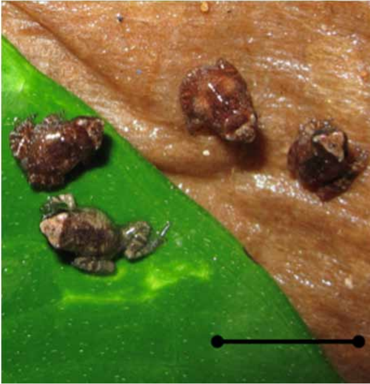
Day old Mozart's Frogs, Eleutherodactylus amadeus . Scale bar is approximately 1cm.