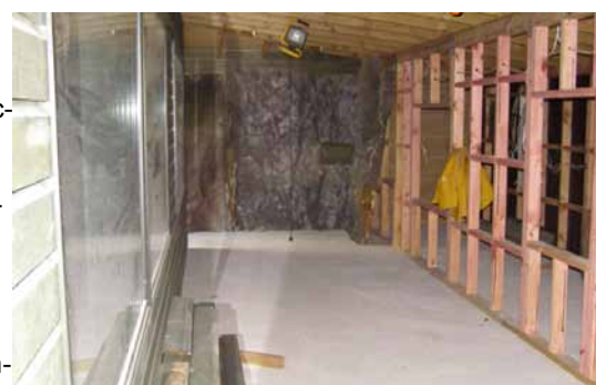
A view from the public walkway through the Frog House. To the left is where the Maud Island Frogs will be housed, and to the right is where some introduced amphibians will be housed.