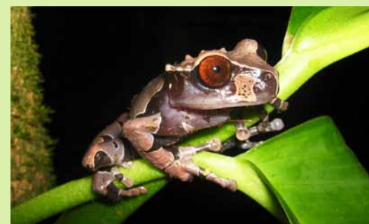
The El Valle Amphibian Conservation Center in Panama maintains a successful population of Anotheca spinosa .