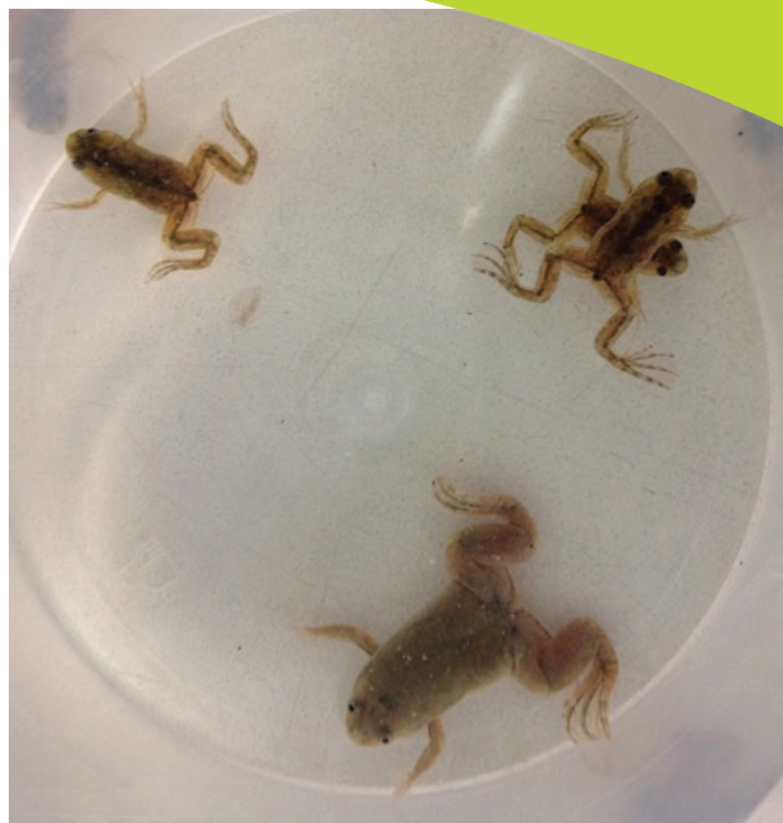
African Clawed Frog ( Xenopus laevis ) juveniles.

quality of the culture aquaria. To build this system, tanks were drilled to ensure continuous water flow through PVC tubes, thereby connecting the aquaria, and finally connecting them to a water filtering system. The structure was built from a plastic tank in which two baskets were placed. When it reaches the baskets, water from the aquaria passes through a layer of fine sand, a second layer of activated carbon and a third layer of zeolyte. It then runs into the tank in which plastic balls, rich in tiny holes, provide additional space for de-nitriphying bacteria to live. At that point the water is pumped out and redistributed to the top shelf aquariums, falling down to the next level in a cascade system.