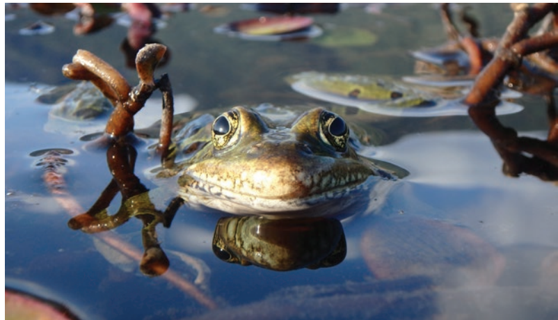
The Northern Leopard Frog ( Lithobates pipiens)

Shrinking range, fewer Northern Leopard Frog populations, and less frogs within those populations led to national Species at Risk Act designations for different populations—'Endangered' for British Columbia's Rocky Mountain population and 'Special Concern' for the Western Boreal/Prairie populations in the Northern Territories, Alberta, Saskatchewan, and Manitoba. In Alberta, the