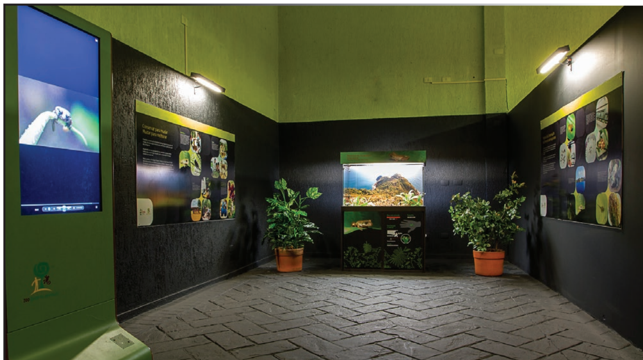
A new exhibit has been created for the Alcatraz Snouted Tree Frog at São Paulo Zoo in Brazil, in a terrarium which represents the natural island habitat of the frogs.

The goal of this exhibit is to provide knowledge about the Alcatraz Snouted Tree Frog and to inspire our visitors to reflect about the importance of amphibian conservation, as well as the whole biodiversity. We hope that more people will understand the role of zoos in this process, and that wildlife conservation depends on the joint effort of different stakeholders, including researchers, governments and society.