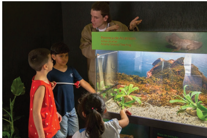
Educational presentations are often held in the "O Pulo do Sapo" (The Leap of the Frog) exhibit by environmental educators.

The Alcatraz Snouted Tree Frog has a special area in the amphibian exhibit "O Pulo do Sapo" (The Leap of the Frog), located in one of the main boulevards of the Zoo. In this area, some live animals are displayed in a terrarium representing the natural habitat of the frogs. The space includes information available to the public through visual communication and through a video that explains about the species and all the steps of the conservation program developed by the Zoo. Educational presentations are often held in this space by environmental educators.