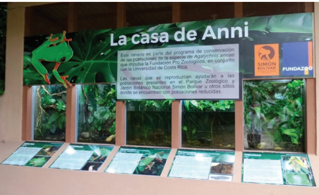
A new education display and exhibit of Orange-eyed Tree Frog was recently opened at the Simón Bolívar Zoo and National Botanical Garden in San José, Costa Rica.