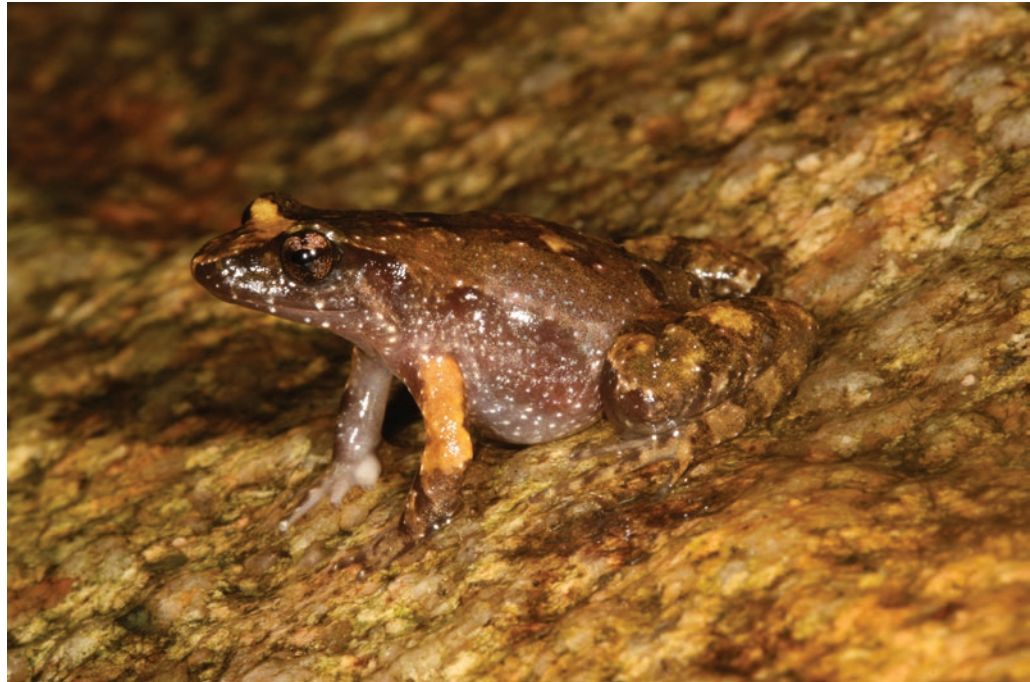
Currumbin Sanctuary in Queensland, Australia, is successfully breeding the Eungella Tinker Frog ( Taudactylus liemi), which is an analog species for the Critically Endangered Kroombit Tinker Frog ( T. pleione).

Fortunately though, for most of these species, Australian zoos and wildlife parks have taken an active role in establishing insurance colonies, in partnership with various state wildlife agency and university partners. These zoological institutions include Taronga Zoo, Melbourne Zoo, the Amphibian Research Centre, Healesville Sanctuary and Tiddinbilla Nature Reserve. The Southern and Northern Corroboree Frogs have each been established in at least three institutions and captive breeding protocols have now been devised. This has permitted the trialing of a number of reintroduction strategies for both of these species. Successful breeding of the Spotted Tree Frog at two institutions over a number of years has resulted in translocation efforts to further investigate the threats to the species and trial chytrid mitigation measures. The Baw Baw Frog has also now been established at two institutions, where husbandry protocols are successfully being developed.