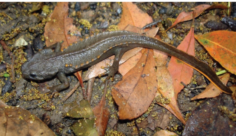
Tylostotriton vietnamensis , an endemic species of Vietnam and recently proposed to list this species in the CITES Appendix III.

Many amphibians are under the risk of decline and extinction and conservation success can only be achieved by our joint effort and collaboration.