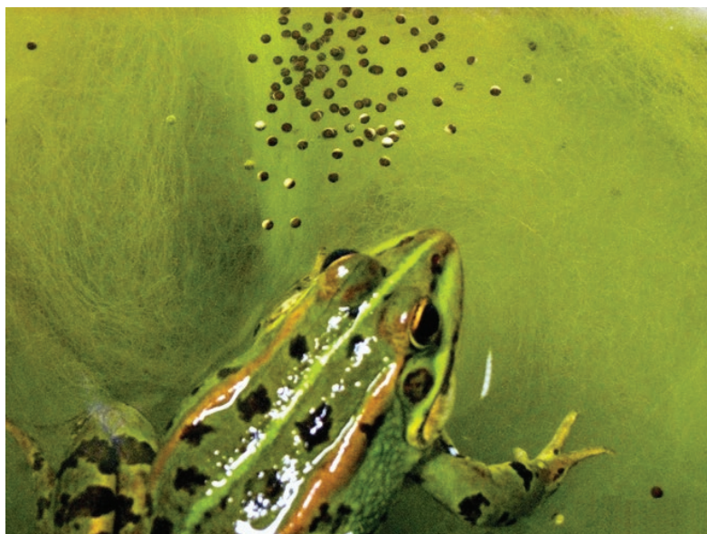
Perez's Frog ( Pelophylax perezi ) adult near an egg mass.

quality of the culture aquaria. To build this system, tanks were drilled to ensure continuous water flow through PVC tubes, thereby connecting the aquaria, and finally connecting them to a water filtering system. The structure was built from a plastic tank in which two baskets were placed. When it reaches the baskets, water from the aquaria passes through a layer of fine sand, a second layer of activated carbon and a third layer of zeolyte. It then runs into the tank in which plastic balls, rich in tiny holes, provide additional space for de-nitriphying bacteria to live. At that point the water is pumped out and redistributed to the top shelf aquariums, falling down to the next level in a cascade system.