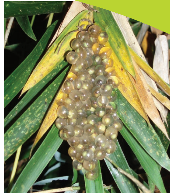
An egg mass from an Orange-eyed Tree Frog. Eggs are laid on leaves, branches or vines, up to 3m above water.