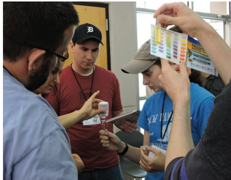
The 2016 North American salamander workshop brought together participants from seventeen institutions, representing zoos, universities and the private sector.