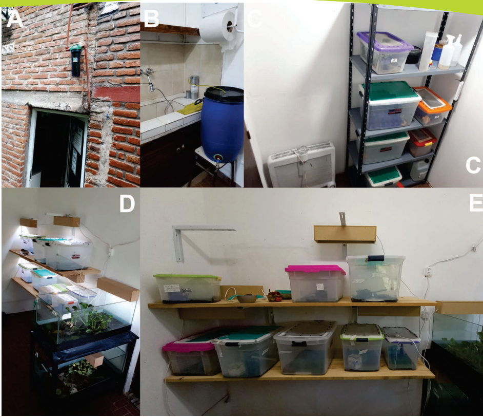
Upgrade works in the ex situ facilities of the Reserva Experimental Horco Molle (UNT), Tucumán province, Argentina. A) External water filter; B) Biological/physical/chemical water filter system; C) Conditioned room for live food raising; D) UV light system; E) Frog container shelving.

quality parameters (conductivity, pH, percentage of dissolved oxygen and total dissolved solids) and environmental water variables (water temperature, air temperature and relative air humidity).