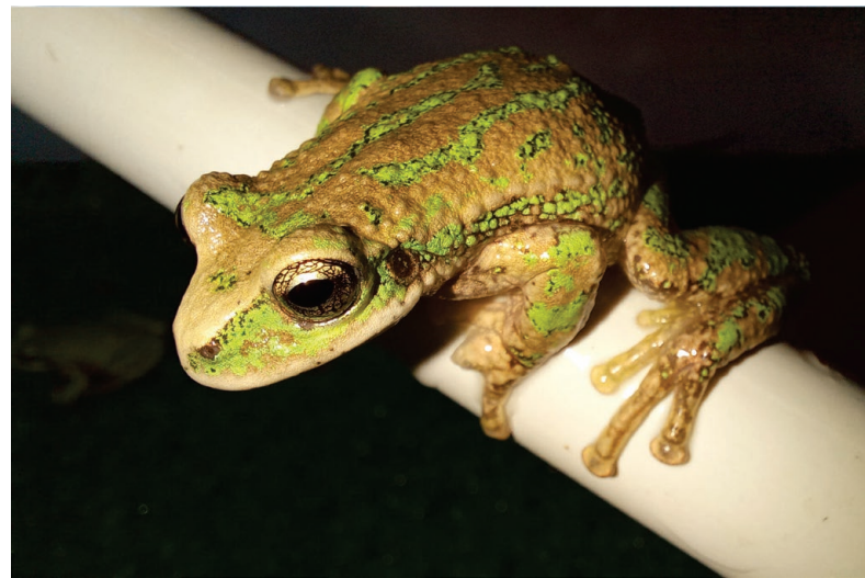
An adult La Banderita marsupial frog ( Gastrotheca gracilis ) housed in the ex situ facilities of the Reserva Experimental Horco Molle (UNT), Tucumán province, Argentina.

Artistic mural on the facade of the ex situ facilities of the Reserva Experimental Horco Molle (UNT).