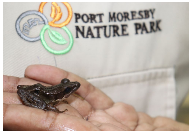
A young wood frog ( Papurana daemeli ) – one of two additional species which have been brought into the captive program to continue to build staff experience and expertise.

Two 20-30 mm long frogs were collected by hand in the Nature Park at night. They were on the ground actively jumping and calling. They were kept in a holding tank in a separate building for two weeks before being moved to the rest of the collection. Here, they were placed in a 30 x 20 x 20 cm terrarium with gravel substrate and small branches; vegetation included creeping charlie ( Pilea nummulariifolia ) and rock weed ( P. microphylla ). This was later changed to philodendron and pothos plants and lengths of PVC piping cut in half to provide more cover and shelter. The tank had small holes in the base and lower sides to facilitate good hygiene and ease of cleaning when hosing surface debris and feces.