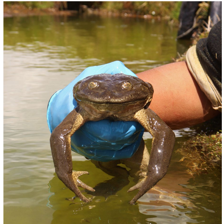
The Lake Junín giant frog ( Telmatobius macrostomus ) is one of the largest fully aquatic frogs in the world.

suggests the probability of extinction within 100 years is 64% with a mean time to extinction of thirty-six years.