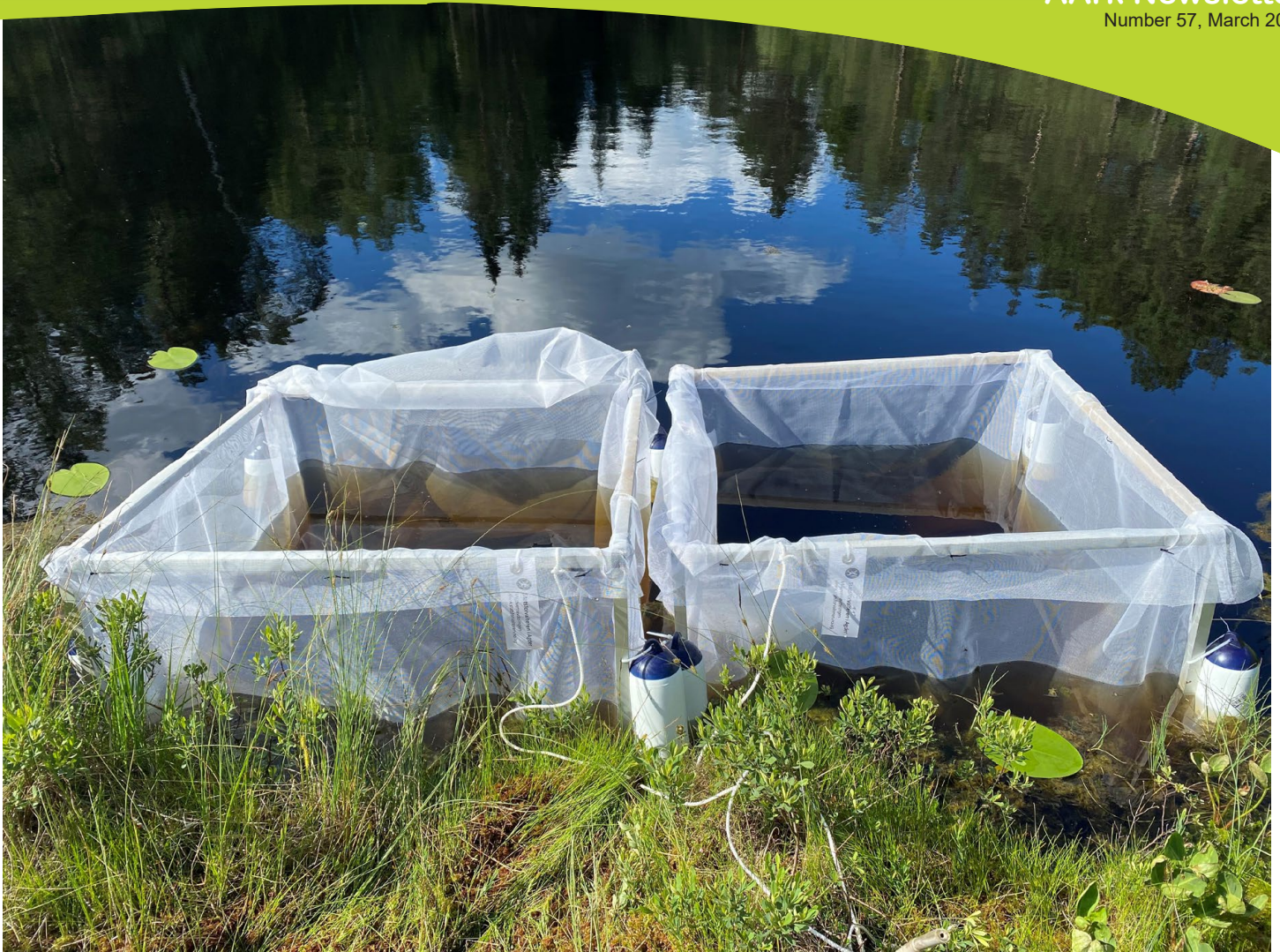
In situ head-starting of northern pool frog tadpoles in Norway.

Following a break, workshop leaders reviewed the spreadsheet responses to facilitate discussion of the seven approaches. Then participants were asked to rank the suitability of each approach for pool frog recovery in England.