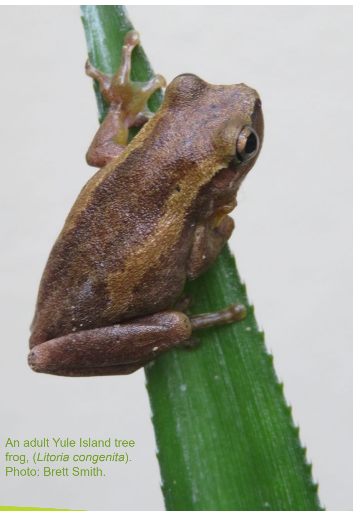
An adult Yule Island tree frog, ( Litoria congenita ).

The Yule Island tree frog occurs in the southern New Guinea mainland, the Aru Islands and Yule Island in Central Province north-west of Port Moresby and a naturally-occurring population in Port Moresby. It occupies a range of habitats including moist savannah and intermittent freshwater marshes, as well as rural gardens, and heavily degraded former forests. Adults reach a maximum length of 45 mm and have a thin pale stripe down the middle of the back, with broken green or brown stripes and speckles against a paler or darker background.