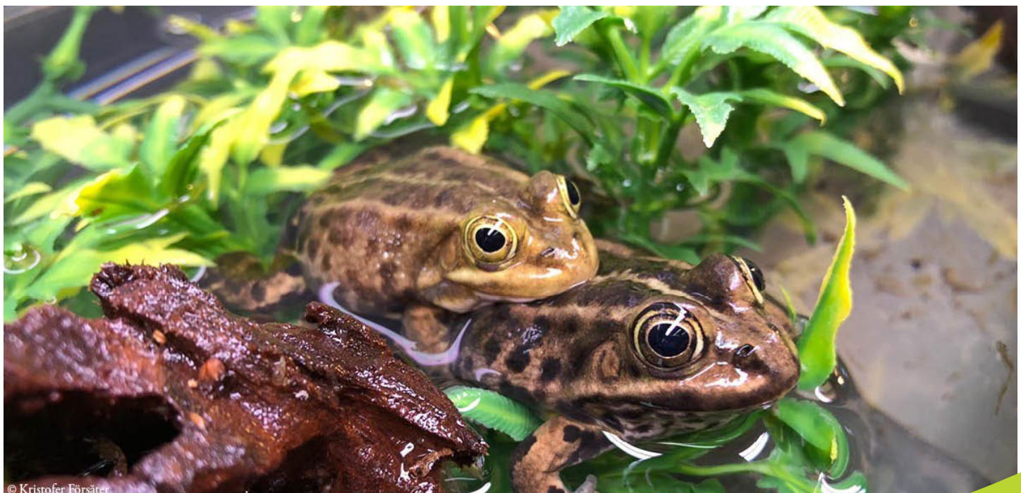
Captive breeding was one of the approaches to future reintroductions of the northern pool frog ( Pelophylax lessonae ) favoured by workshop participants.