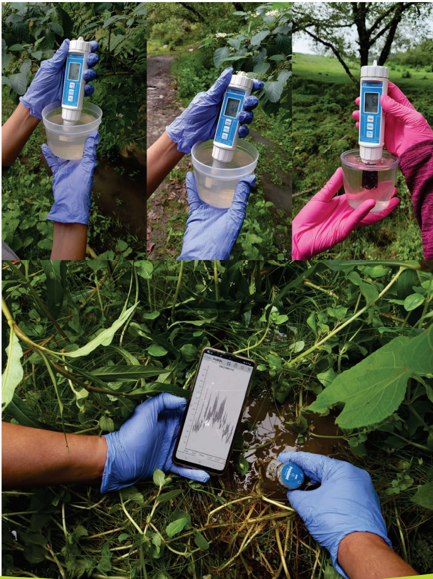
Assessment of water quality parameters and environmental variables of the reproductive sites used by marsupial frogs in the Reserva Provincial Los Sosa and Parque Nacional Aconquija, Tucumán province, Argentina.

We plan to invite the National Parks Administration to join us in this project and to establish a rescue/supplementation program of Gastrotheca gracilis in the Parque Nacional Aconquija, in particular, at the type locality of the species in "La Banderita". We will continue with our captive breeding attempts and will hopefully obtain the first cohort of ex situ raised individuals of La Banderita Marsupial Frog in 2022.