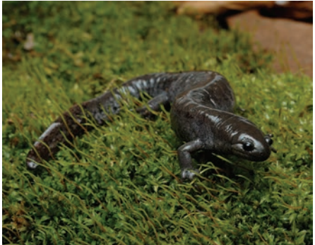
Small-mouthed Salamander (Ambystoma texanum)

Amphibians are also important indicators of environmental health. The same thin skin that helps them to drink and to breathe also makes them susceptible to pollutants, more so than other tetrapods. For example, consider Atrazine, the most widely used herbicide in the US and probably the world, and a potent endocrine disruptor. At low concentrations of Atrazine--lower than those the USDA says is safe in drinking water and lower than those found at the tap in millions of American homes--male clawed frogs can be chemically sterilized or even turned into females (Hayes et al. 2010). Because of their generally conspicuous presence in the environment and chemical sensitivity relative to other tetrapods, amphibians can be a considered a canary in the coalmine, valuable sentinels for human health concerns.