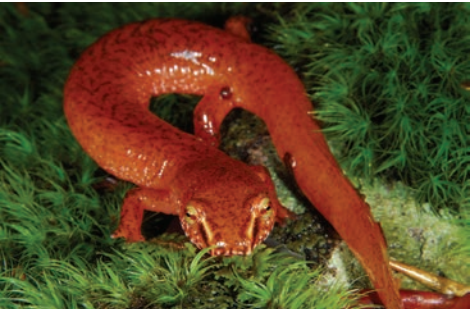
Spring Salamander (Gyrinophilus porphyriticus)

Foden et al. (2008) predicted that 52% of amphibian species are likely to be 'particularly susceptible' to climate change, based on biological traits like "specialized habitat requirements, limited dispersal ability and water-dependent larvae." Over one half of these species are ones that are not currently threatened, potentially pushing the number of threatened amphibians from 32% to 60% and quadrupling the number that require rescue. In other words, even though the amphibian extinction crisis is already the greatest in the history of humanity, we ain't seen nuthin' yet.