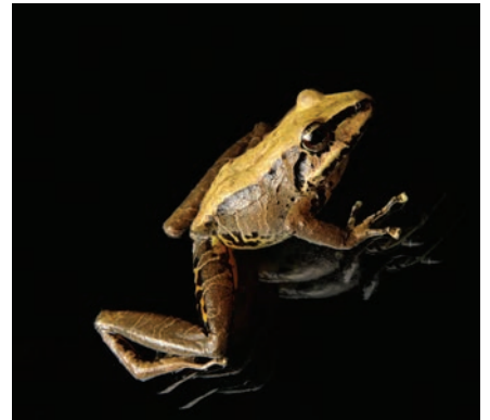
Zurucuchu Robber Frog (Pristimantis w-nigrum)