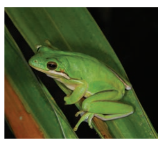
Green Tree Frog (Hyla cinerea)

Amphibians are an important component of the global ecosystem. In New York State, the biomass of one diminutive salamander species alone is equal to that of all the white-tailed deer. If you think that is impressive, that same salamander species in Virginia has a biomass 7x as great, another salamander species in Japan